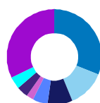
Investment mix (April 30, 2022)